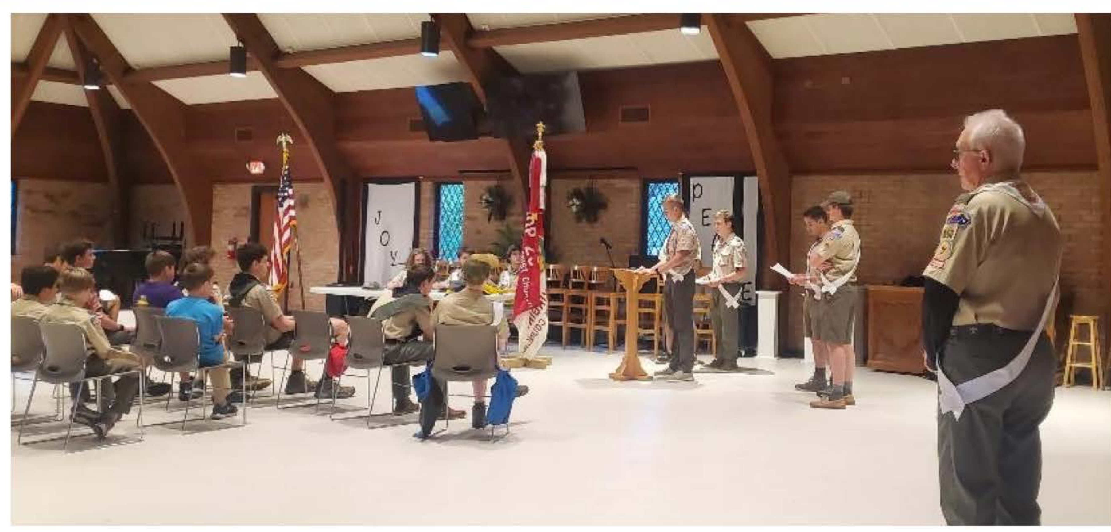
Members of Koo Koo Ku Hoo Chapter conduct an election for Troop 29 in the Piedmont District

Koo Koo Ku Hoo .. Lappilennin .. Mingo Moneton .. Tuscarora .. Wil Kip Jo