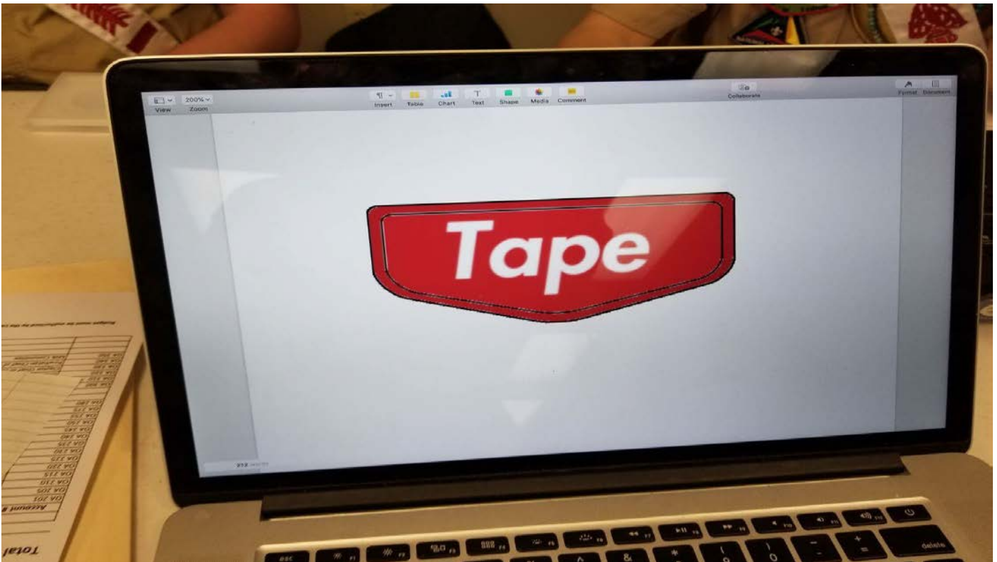
1. Edward Blount's Batch design before being modified to meet patch standards. Voted to be our conclave patch.