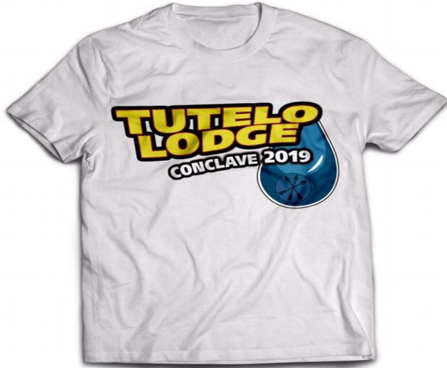
3. Proposed front of our Conclave shirt