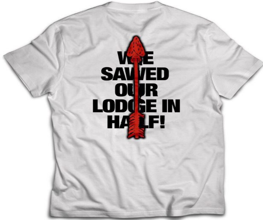
4. Proposed back of our Conclave shirt