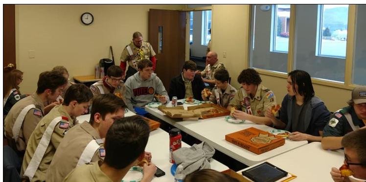
Mingo Chapter members enjoy pizza at their January meeting.

Moneton Chapter had a great turnout for Winter Banquet. The food was great! Our last few meetings have been very productive setting goals for this year which include increasing membership, improving communication, and being involved in more service projects. Our chapter looks to have a good turn out at Conclave as well. Also, Moneton has a new Remind system for communication and announcements. That said, we look forward to the new year. Our next meeting will be at Central United Methodist Church in Radford