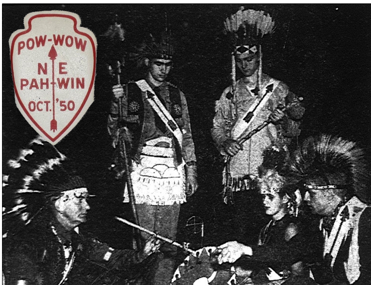
Members of Ne-Pah-Win Lodge's ceremonial team at the 1950 pow wow on Treasure Island. The neckerchief slide that commemorated the event is shown to the upper left.

At this meeting, the lodge decided that its mission would include tracking on an annual basis civic service projects and hours performed by Scouts of the Piedmont Area Council. A committee was charged with developing this program, including an award that would be presented to Scouts completing a certain amount of community service. The