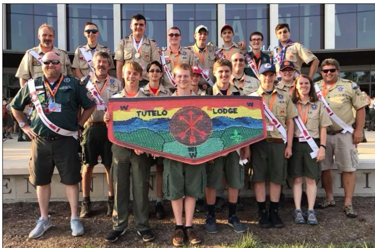
Tutelo's NOAC contingent gathered in front of the Simon Skjodt Assembly Hall at Indiana University for this quick group photo.

There was something at NOAC for everyone, including training, patch trading, sporting events, shows, ceremonial evaluations, American Indian activities, exhibits and displays, and a campus-wide game called "Seek" that used electronic armbands to link up with other participants and check in to