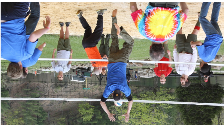
Tutelo's volleyball team (in blue) at the 2012 SR-7A Conclave: the last time we were at Camp Rock Enon.

On the weekend of April 27-29, 2017, more than 150 Tutelo Arrowmen will join over 1,000 brothers from around Virginia and beyond for the Southern Region Section Seven A Conclave at Camp Rock Enon in Gore, Virginia (near Winchester). Like Camps Powhatan and Otter, Rock Enon is nestled in the Blue Ridge Mountains and is truly a special place to visit.