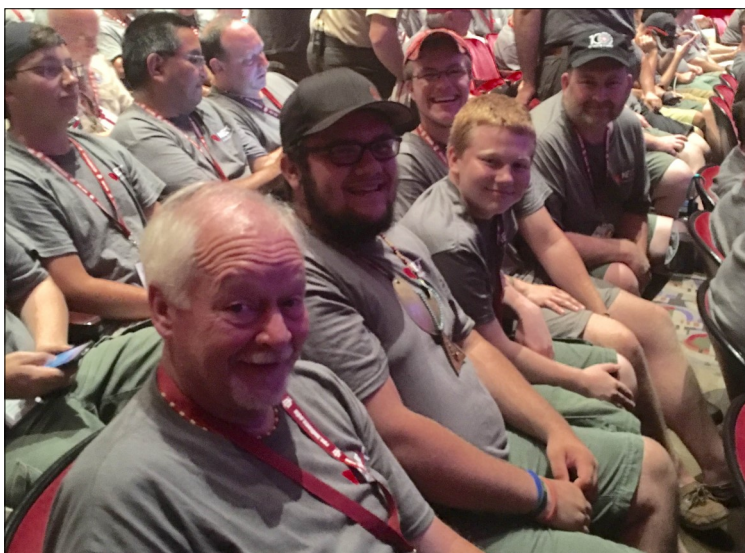
Above: The Tutelo delegation to NEXT prepares for a show in the auditorium at Indiana University.