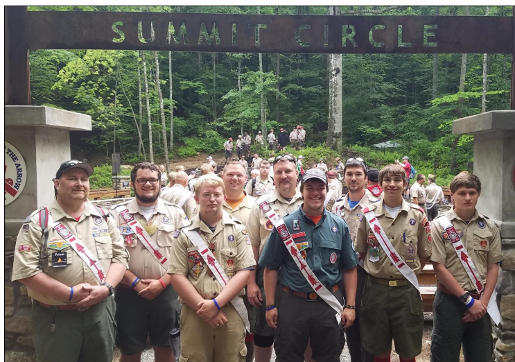
Tutelo's Prism contingent prepares to enter the newly-dedicated Summit Circle at the Summit Bechtel Reserve in New Hope, WV.