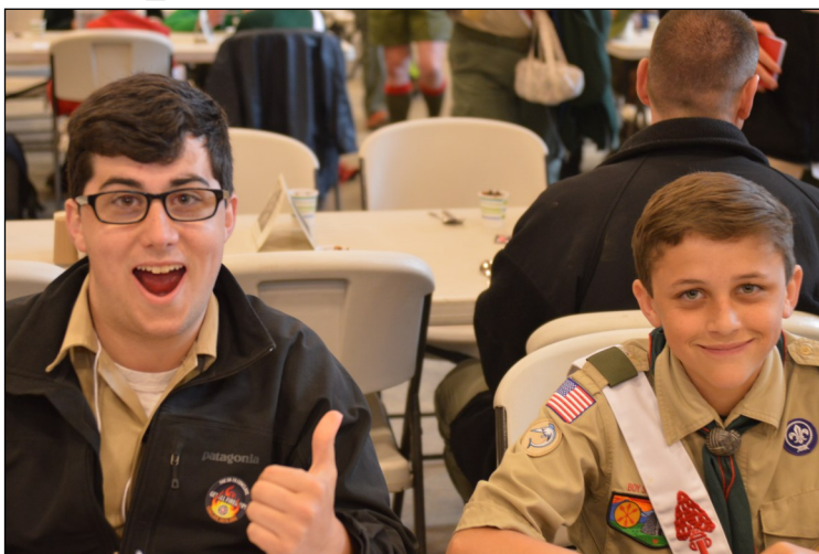
Above: The New Arrowman Luncheon (attended by all brothers who were inducted last year plus each lodge chief) is one of the many highlights of Conclave.