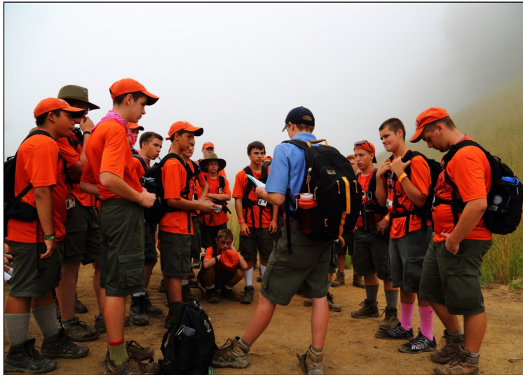
Above: An OA Trek Guide prepares a Jamboree troop for its early morning hike to Garden Ground Mountain.

The Operation Arrow team has been accepting applications to join our staff since October 2015, and our quota is filling quickly. Interested Arrowmen can find more information on our program areas and a link to apply by visiting the Operation Arrow website ( http://event.oa-bsa.org/events/jambo2017/ )