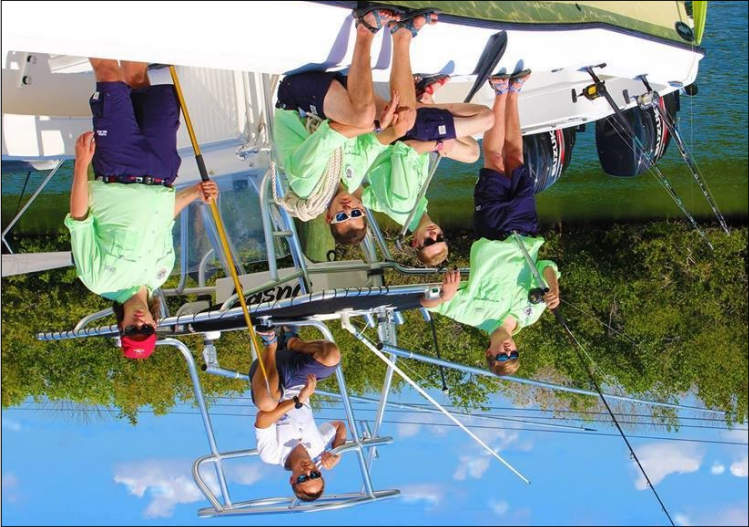
OA Ocean Adventure Staff at Florida Sea Base.